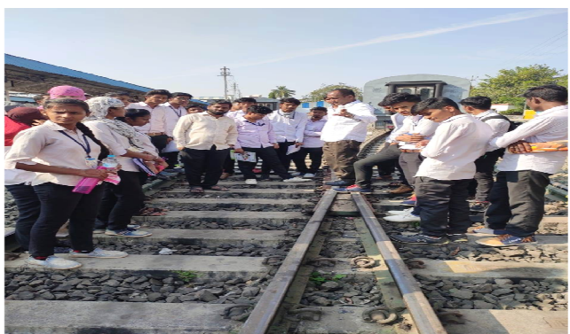
Railway Station Solapur (SY CIVIL)