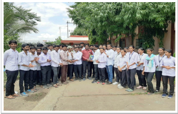
Water Treatment Plant, PAKNI (TY CIVIL)