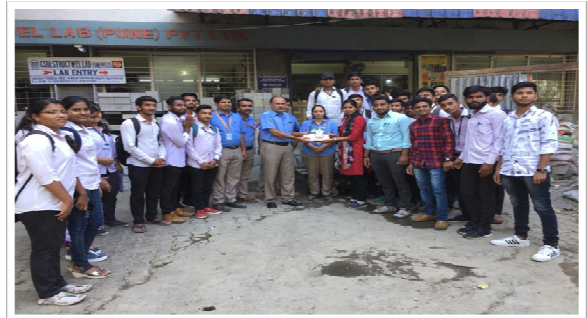
Structural Consultancy Pvt.LTD Pune (TY CIVIL)