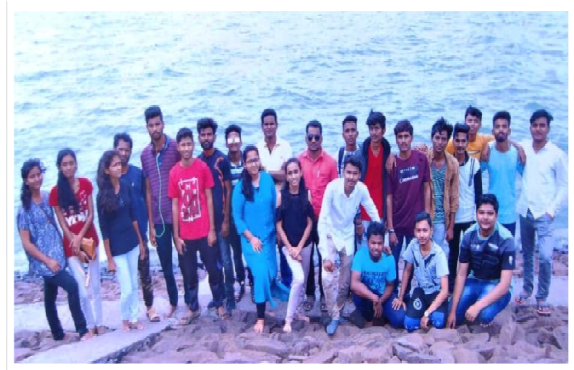
Jayakwadi Dam Paithan (TY CIVIL)