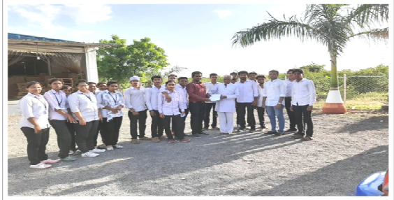
Spenca Water Treatment plant Shirapur Mohol (TY CIVIL)